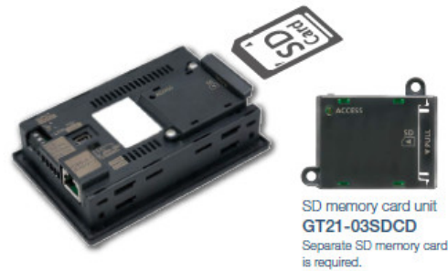
SD memory card unit GT21-03SDCD Separate SD memory card is required.

SD memory cards can be used when the optional SD memory card unit is attached.